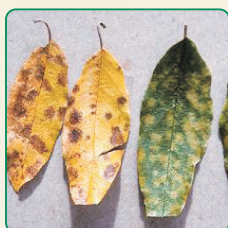
Cercospora Leaf Spot