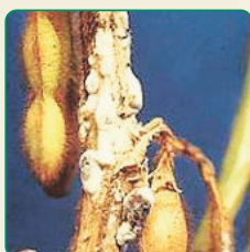
Sclerotinia Stem Rot